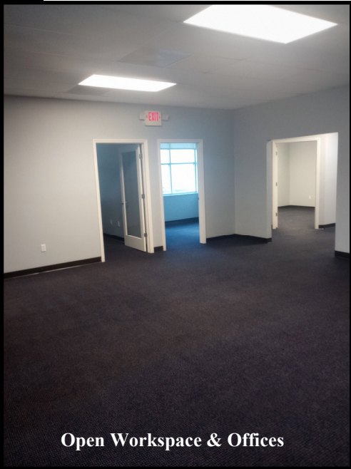
Open Workspace & Offices